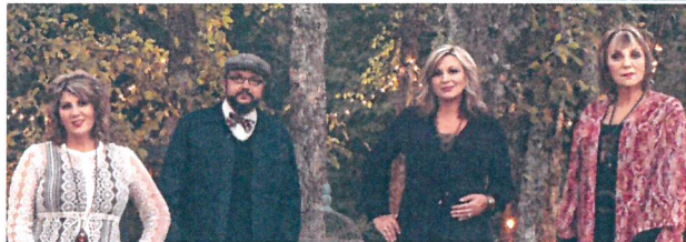
March 30, 2019 at 6:00 p.m.